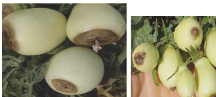
Figure 1- Bacterial disease of apical rot of the Novichok breed

During the period of active growth of the vegetative mass, during the period of seedlings, every 3-4 days, the soil was loosened. The emergence of plant diseases was observed on leaves and sprouts. Since the tomato crop was planted in the open ground, yellowing and color change of the lower leaves was observed. There was also constant monitoring of the appearance of diseases and the formation of tomato fruits, and chemical treatment was not carried out. Thus, according to the methods described above, observations were made in all regions. According to the purpose of our study, the main and constant attention was paid to determining the resistance of tomatoes to diseases (figure 1).